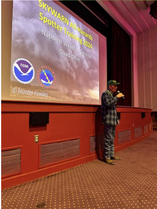
Weather Spotter Class