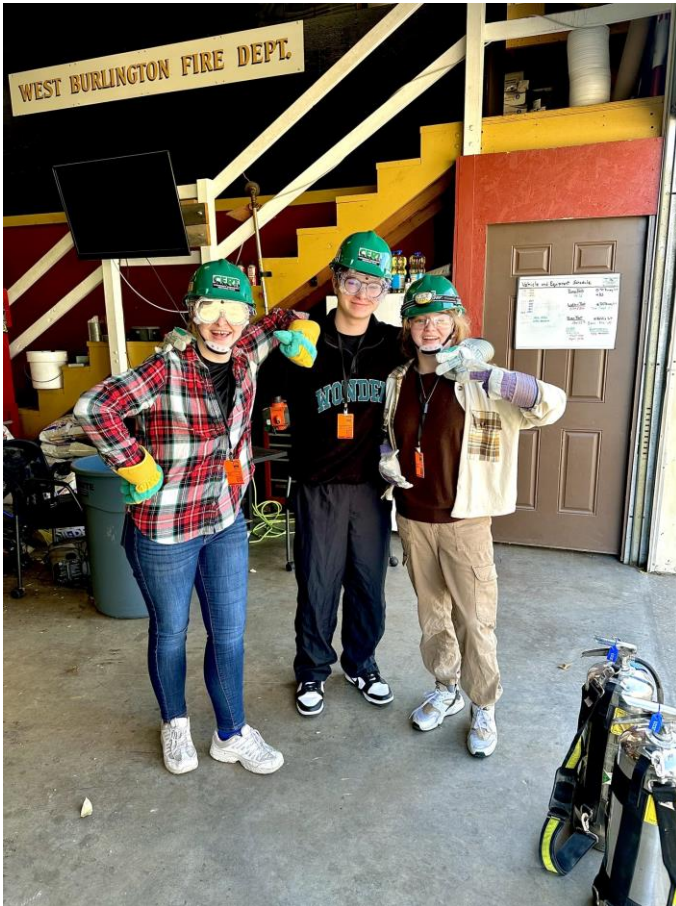
Team Building Exercise