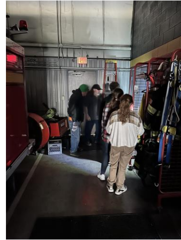
Search and Rescue & Cribbing