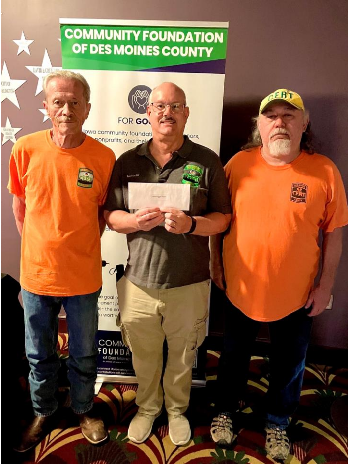
Community Foundations Awards Ceremony