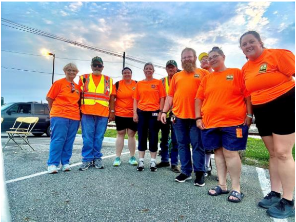
National Night Out